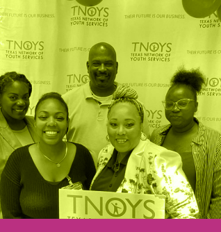
$60,000 in mini-grants supported TNOYS members