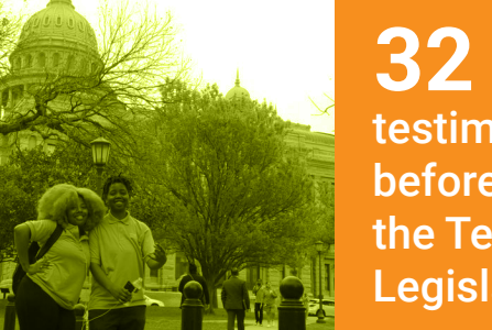
testimonies before the Texas Legislature