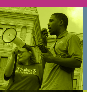
$150 million in new funding impacted by TNOYS legislative advocacy